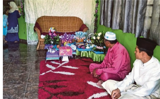
NATION Apr 16, 2020 @ 2:58pm Marriage solemnisation is now allowed in Perak but with conditions