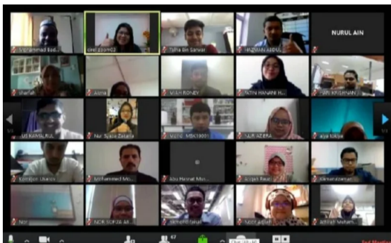
NATION Apr 22, 2020 @ 6:08pm USM students, lecturers give thumbs up to online learning during MCO