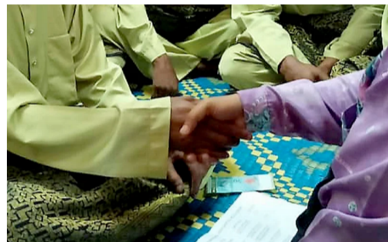
NATION Mar 21, 2020 @ 3:25pm Marriage solemnisation ceremonies in Perak to be postponed with immediate effect