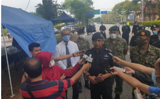
NATION Mar 25, 2020 @ 2:39pm 29 Perak cops and family members under self-quarantine