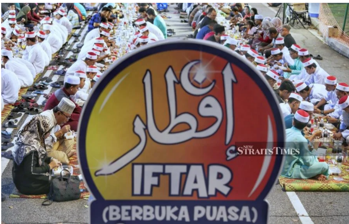
File Photo: The state government will introduce S.M.A.R.T Iftar @ Perak, a drive-through service for the people to buy their favourite delicacies, between 3pm and 6pm, during the fasting month.

IPOH: The state government will introduce S.M.A.R.T Iftar @ Perak, a drive-through service for the people to buy their favourite delicacies, between 3pm and 6pm, during the fasting month